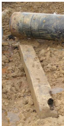
One of the wooden batons