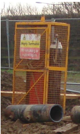
Gas Bottle Cage

During work on a construction project, a gas bottle cage was being positioned close to the work area in preparation for some cutting and welding work. Two wooden batons were positioned on the ground to spread the load of the cage and provide a level footing; the cage was then lifted onto the wooden batons using a 360° excavator with lifting hook and chains. After settling the cage on the batons the lifting chain was removed and the excavator arm moved away. A short while after the cage was released from the lifting chain it suddenly started to topple toward where the Contract Supervisor was standing with his back to the cage (about 1.5m away). As the cage started to fall, a warning was shouted, but the Supervisor was unable to move his leg out of the way fast enough due to suction from the muddy ground, his leg was trapped by the top of the bottle cage. The cage was lifted off and emergency services summoned to site, the contractor was found to have suffered a multiple fracture to his lower left leg.